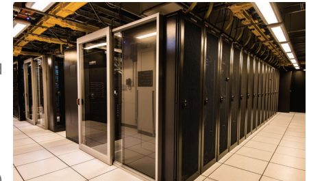
Equinix HK1 IBX colocation