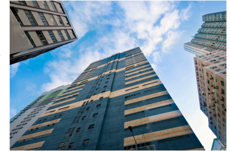
Equinix HK1 IBX exterior